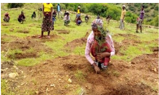
Photo left: The Geco Youth Development group is planting at Debre Zeyt. Photo right: Same at Dukem, several youth groups are planting.