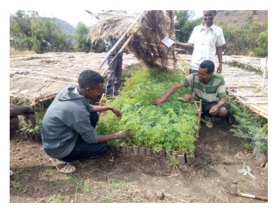
Photo left: Forestry experts control the quality of the seedling before they are transported. Photo right: before tree planting, farmers are instructed about their duties and careful handling of plants.