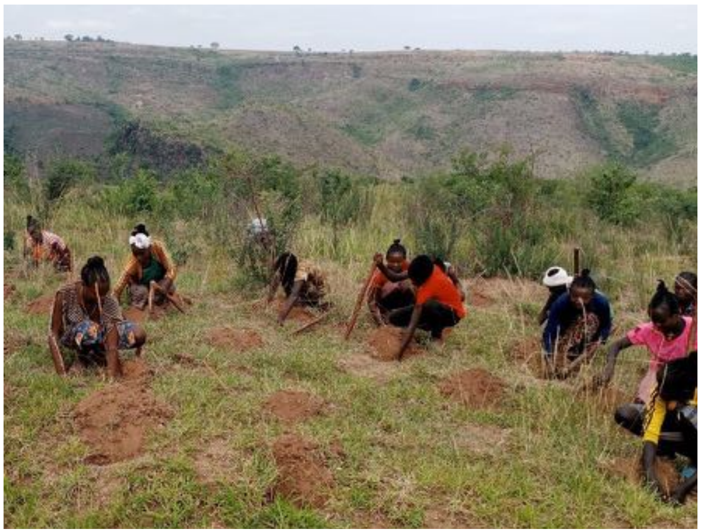
Member of the Dara Women Development Association, planting trees in Sidamo area