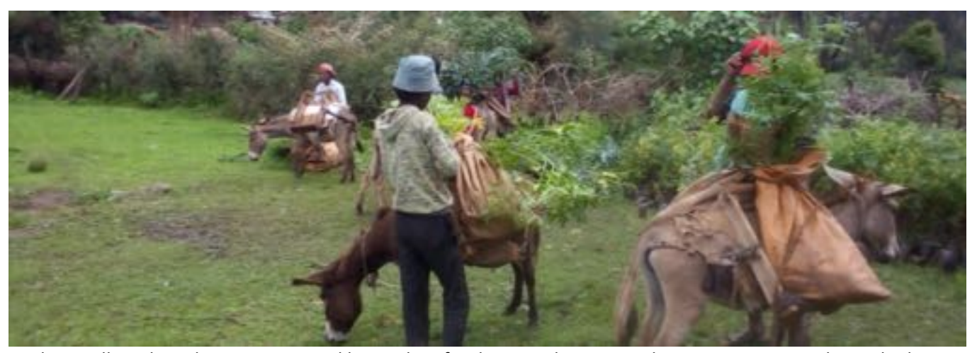
The seedlings have been transported by truck as far they can drive up to the mountain. From there, donkeys transport the seedlings further up the steep ways, and finally on the rocky and slippery last part to reach the mountain tops usually humans are the ones carrying the seedlings to the place of planting.