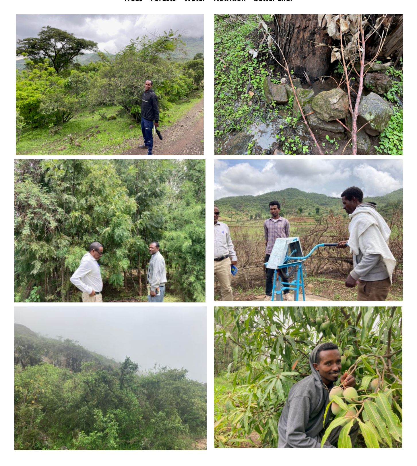
Trees - Forests - Water - Nutrition - better Life.

One of our partners wrote in the annual report the following remark: