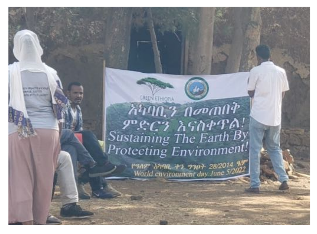
This photo shows the gratitude of our partners. This poster was made for the World Environment Day on June 5<sup>th</sup>, 2022.