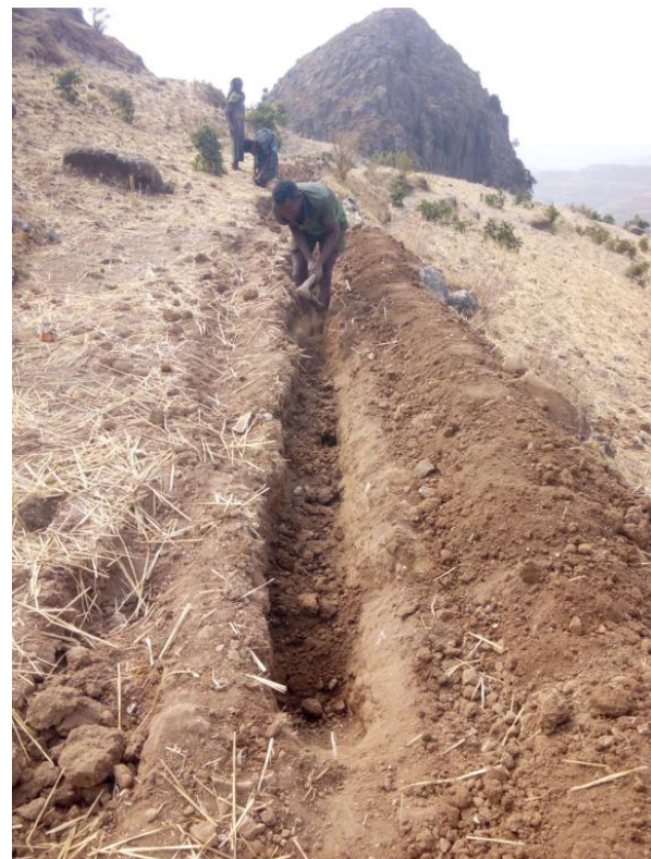
Farmers are making preparations for reforestation.

Women's group of the Weliso Youth Cooperative are caring for coffee seedlings