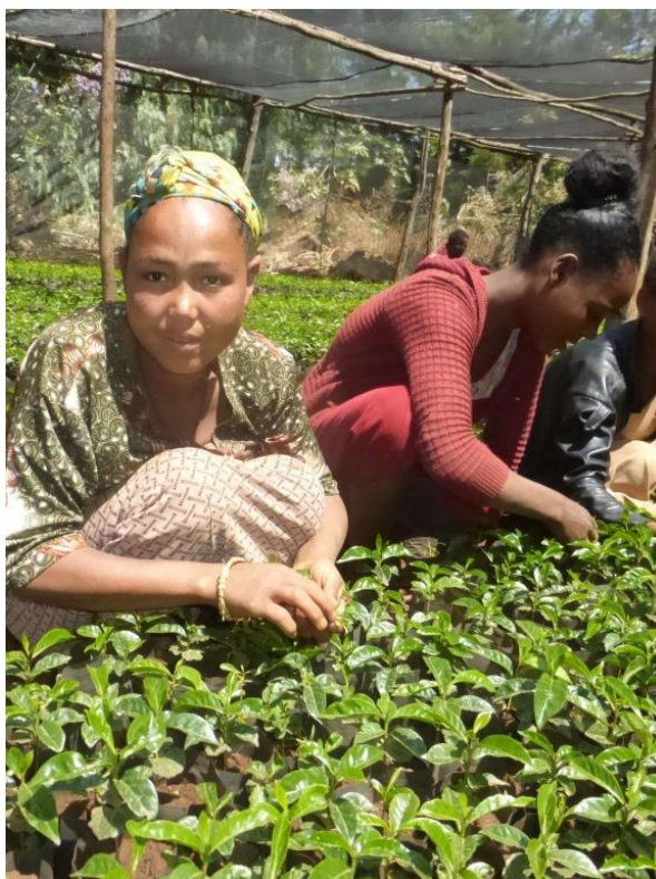
Women are taking care of the seedlings in the tree-nurseries

During the first 4 months, the main activities focused on seedling production and preparing the mountains for reforestation.