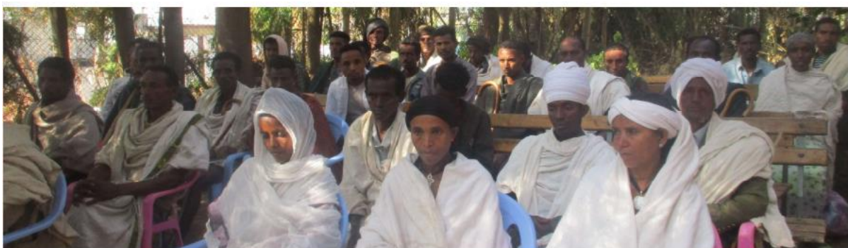
Farmers from the planting group "Ashito" are trained and instructed for their work during a meeting.

Photo on the right: women from the Adame group are returning to the village of Adama after work.