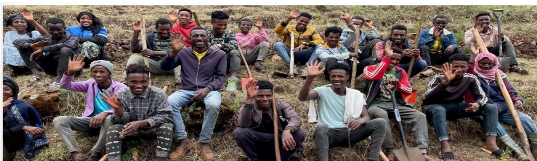
Landless youths in Tiyo, Arsi Mountains, preparing the reforestation.

All in all, we can be very satisfied and grateful regarding the 4 first months. We are especially grateful towards our sponsors and donators who, despite the high demand for donations following the war in Ukraine, remain loyal to us and continue to support us in a great way. Many thanks.