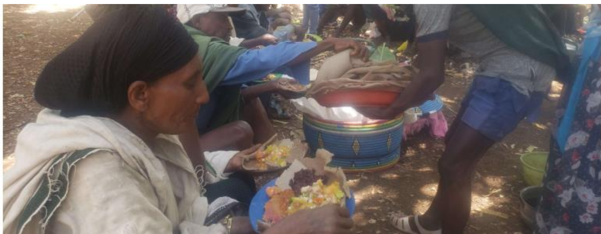
Together with the flatbread, vegetables are Ethiopian's staple food